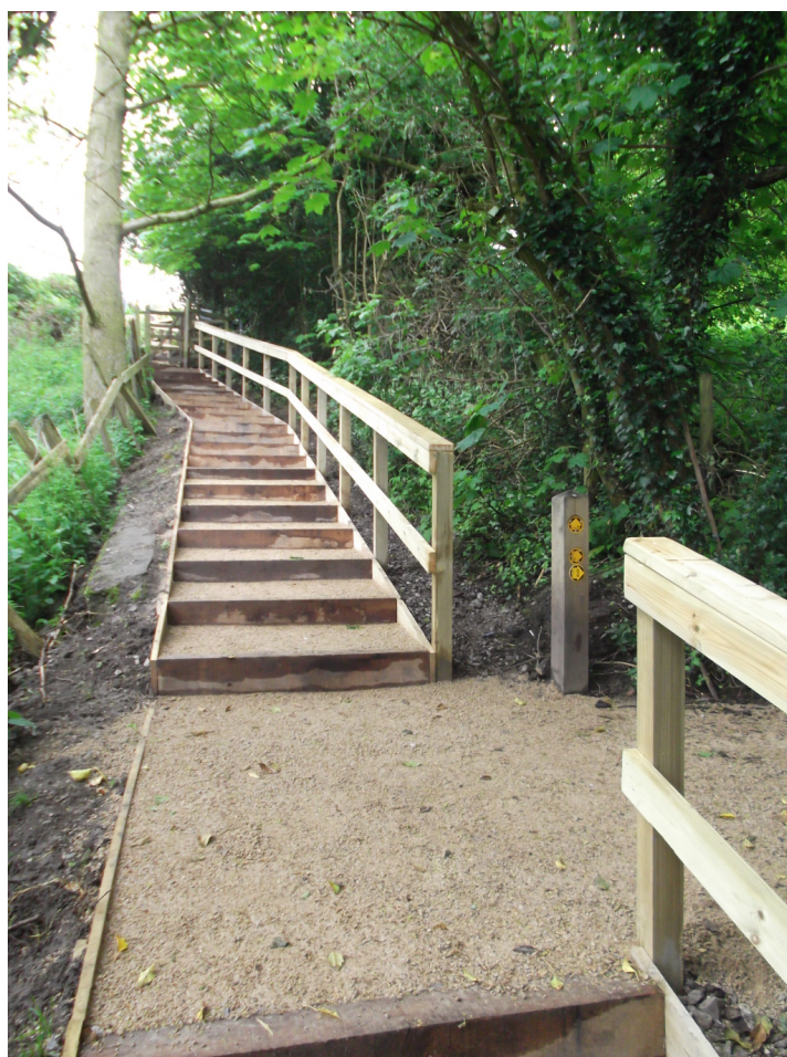
Improved steps on Footpath No. 3 providing access to the Dane Meadow in Holmes Chapel