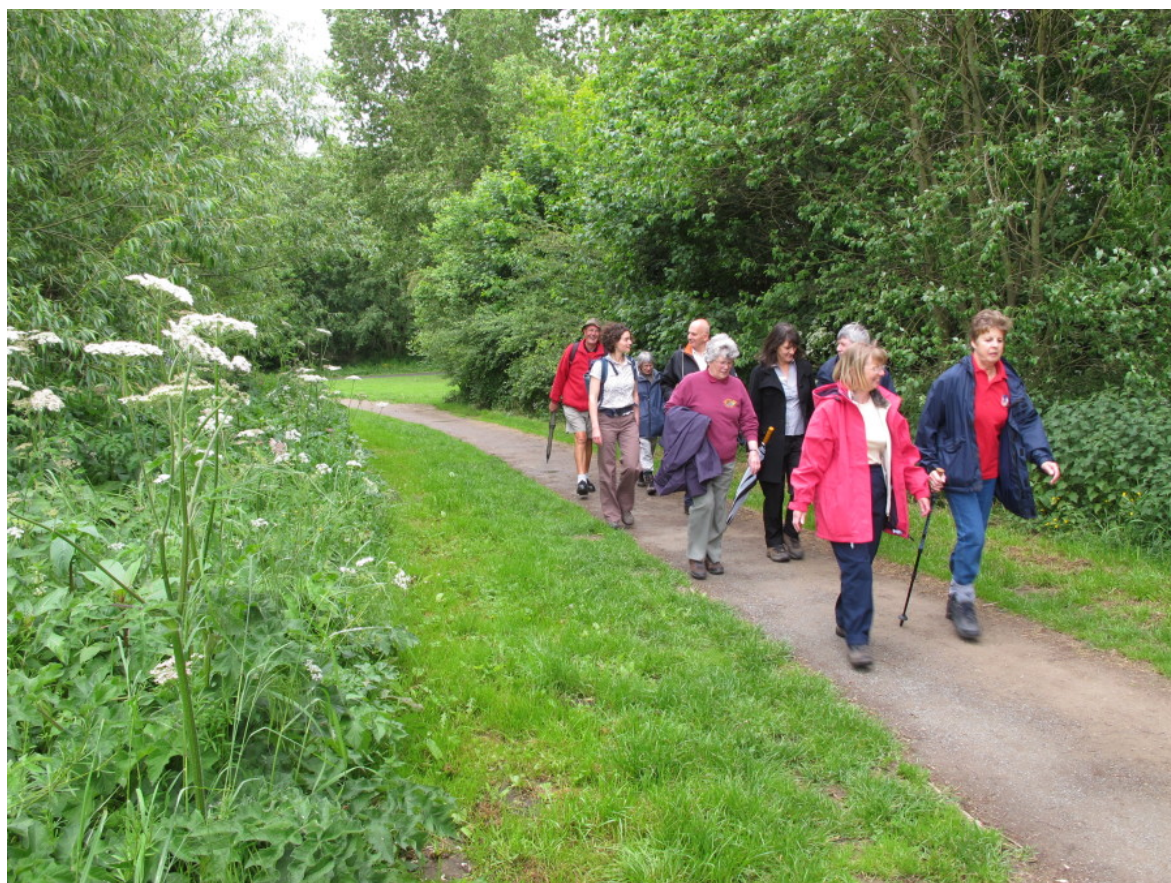
Walkers on the Nantwich Riverside Loop launch event