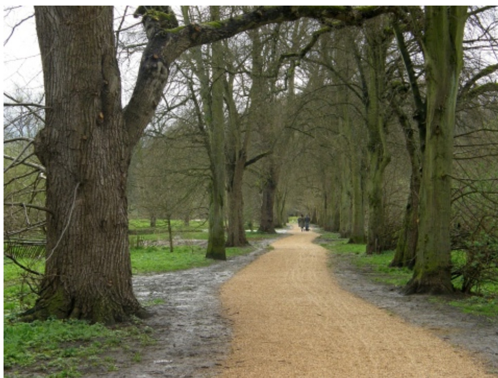
The multi-user route through the Carrs, Wilmslow, after the Paths for Communities project